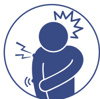
Bites and stings

You can use the virtual Emergency Department if you are having an urgent medical issue that is not life-threatening.