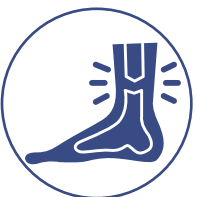
Sprains and minor injuries